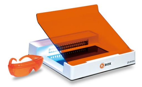
B-BOX<sup>™</sup> Blue Light LED epi-illuminator

The latest version of the manual can be downloaded from <u>www.smobio.com/shop</u>.